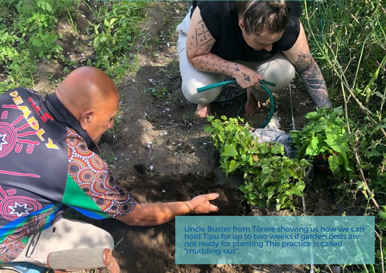
Uncle Buster from Tōreere showing us how we can hold Tipu for up to two weeks if garden beds are not ready for planting. This practice is called "mudding-out".