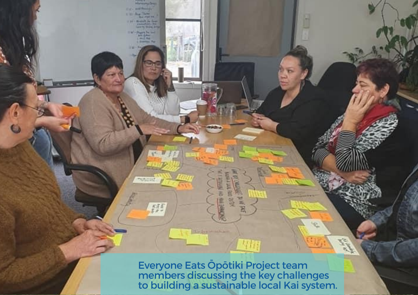
Everyone Eats Ōpōtiki Project team members discussing the key challenges to building a sustainable local Kai system.